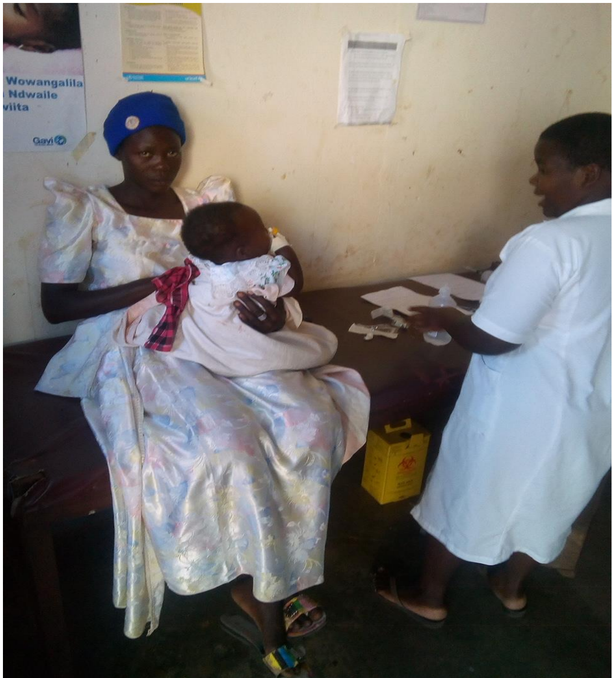
A nurse providing health education to In patient.