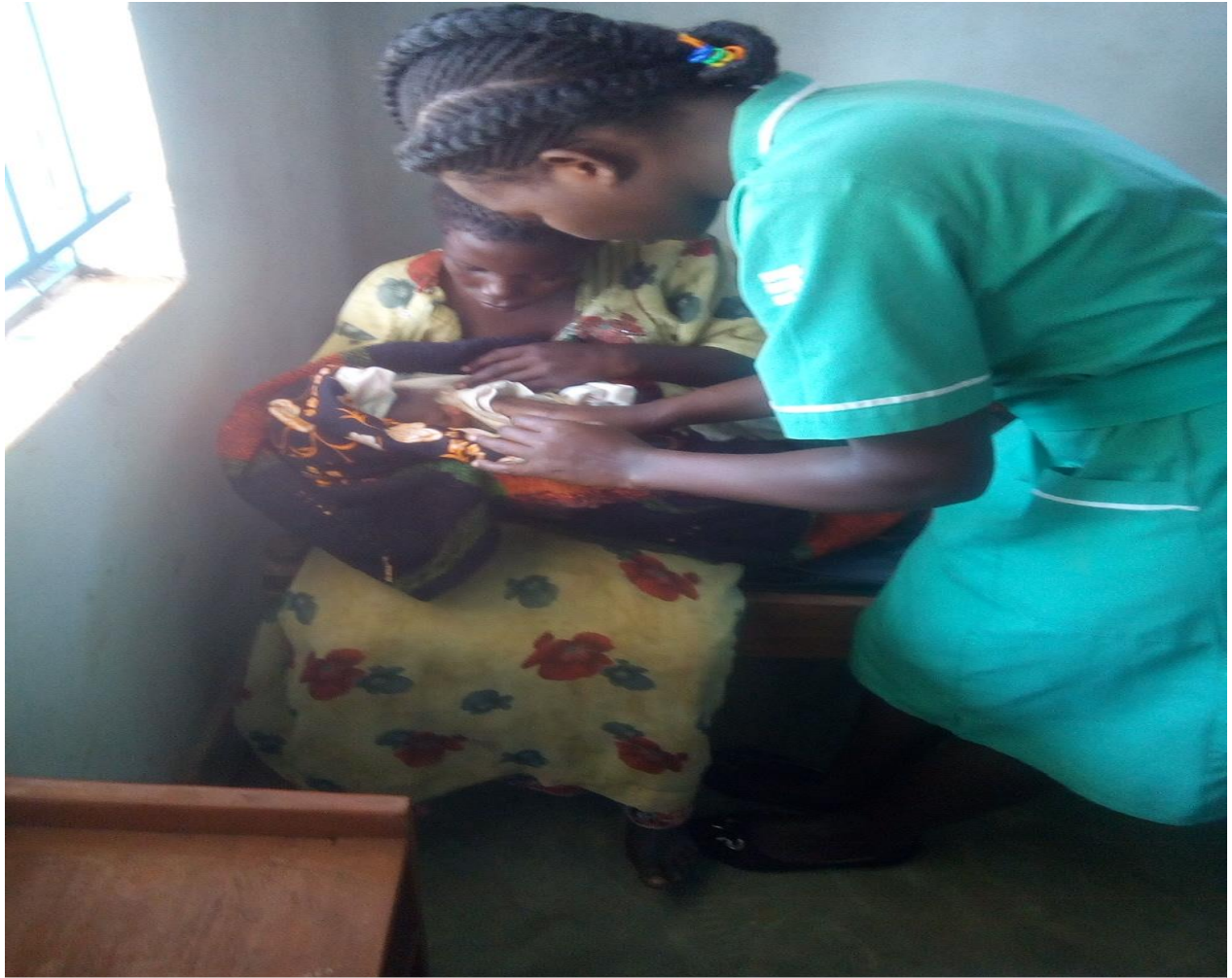
A midwife examining a newly born baby