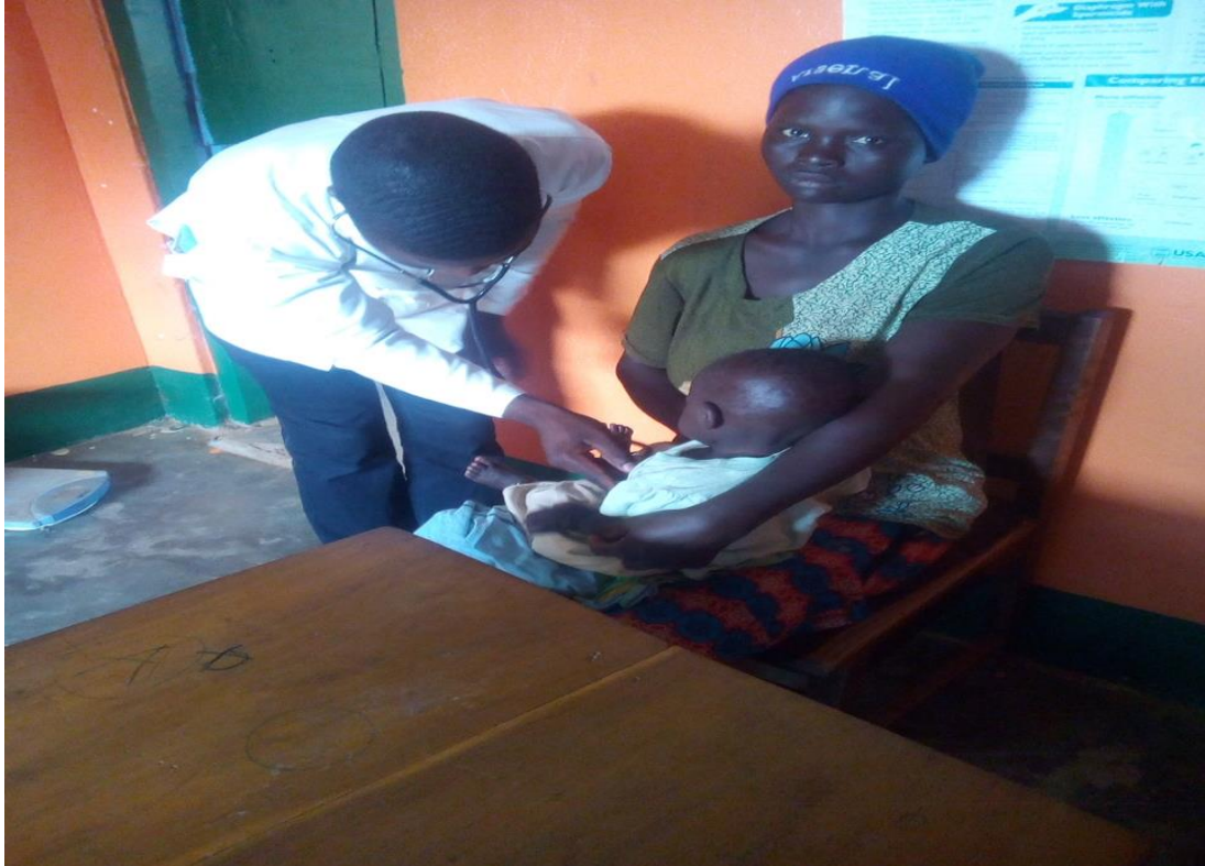
A clinical officer examining a child in a consultation room.