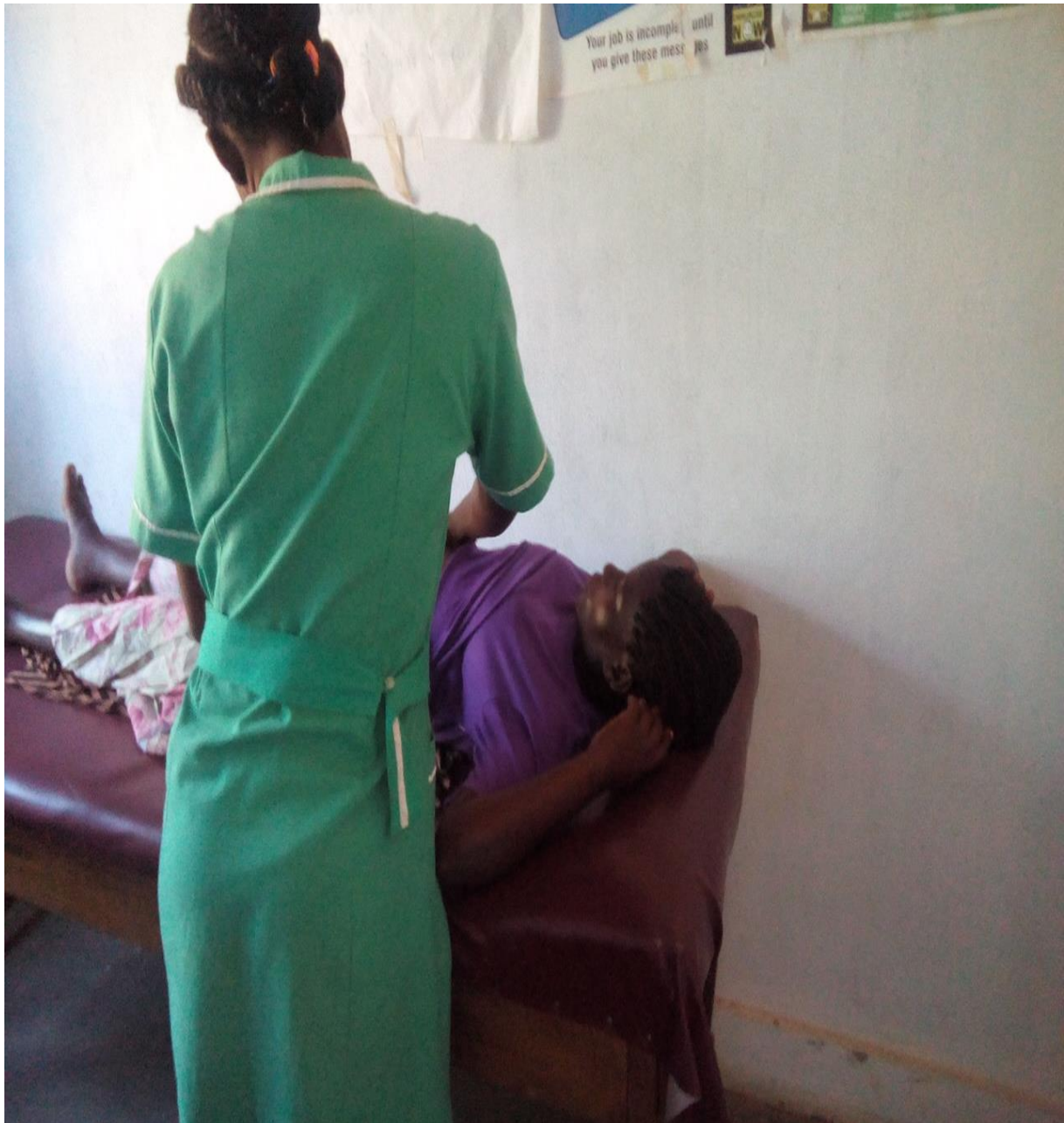
A midwife palpating a mother