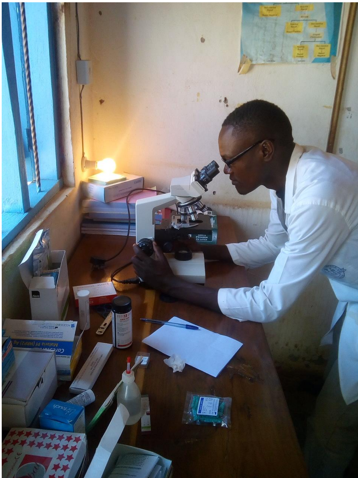
A Lab Assistant performing a B/S test for malaria parasite.