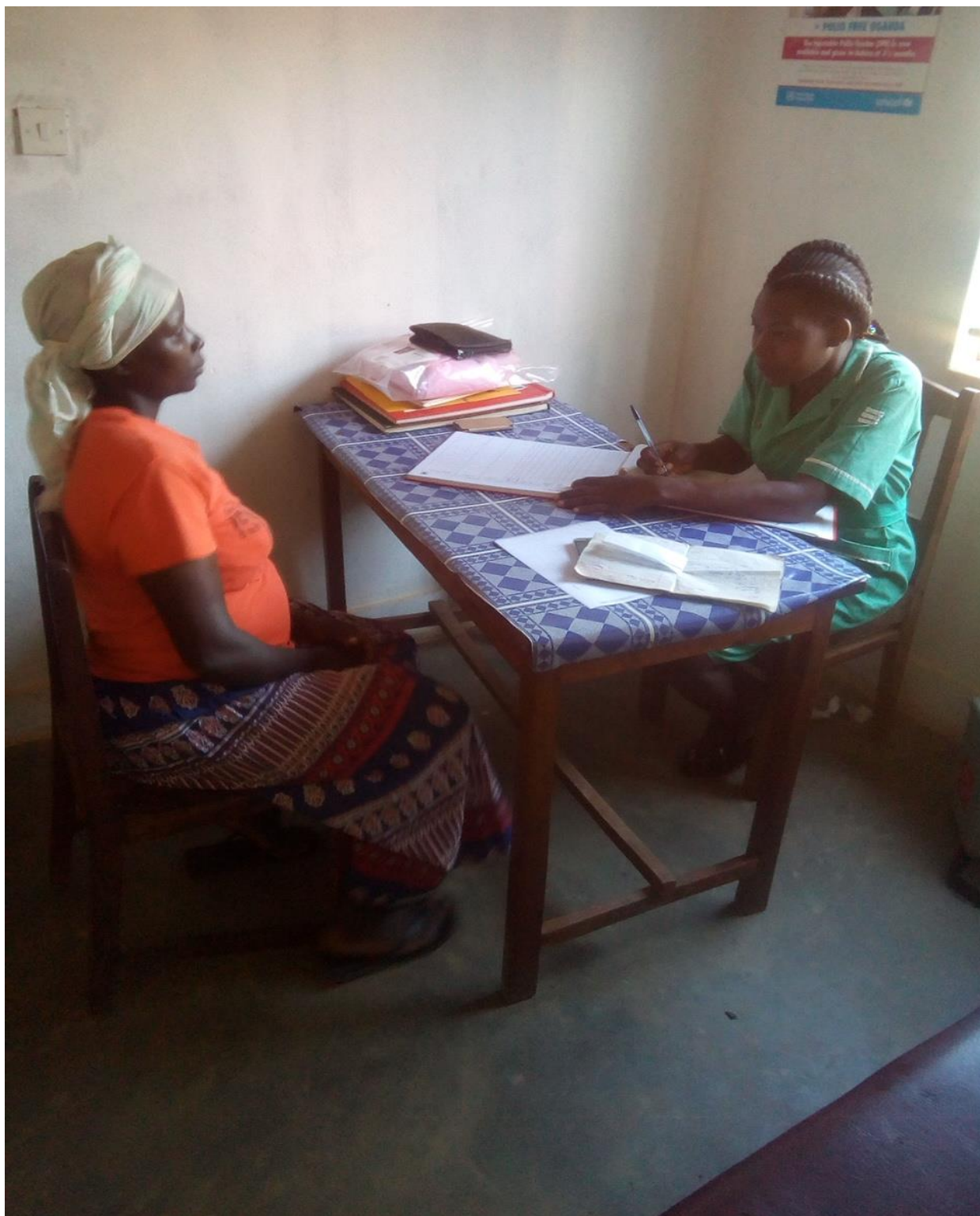
A mother booking for antenatal visits