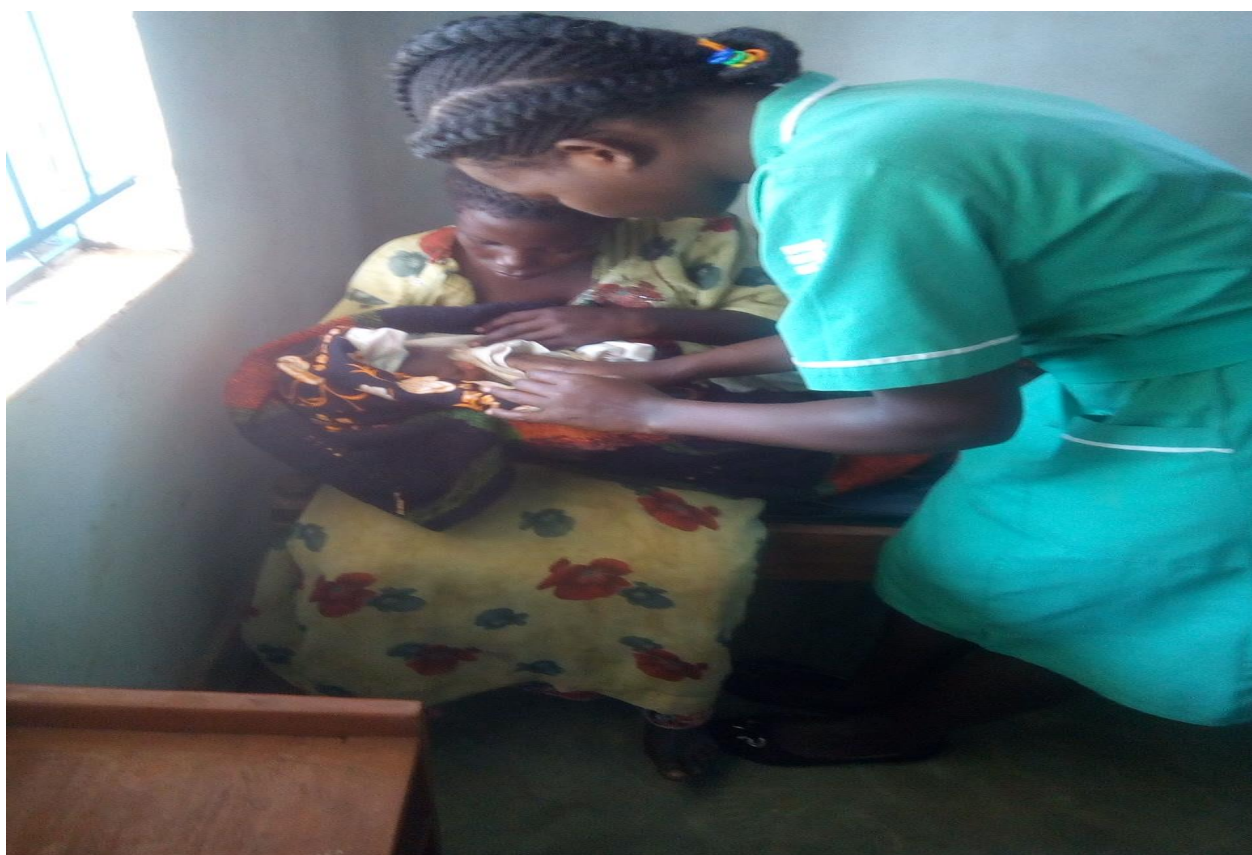
A midwife examining a newly born baby