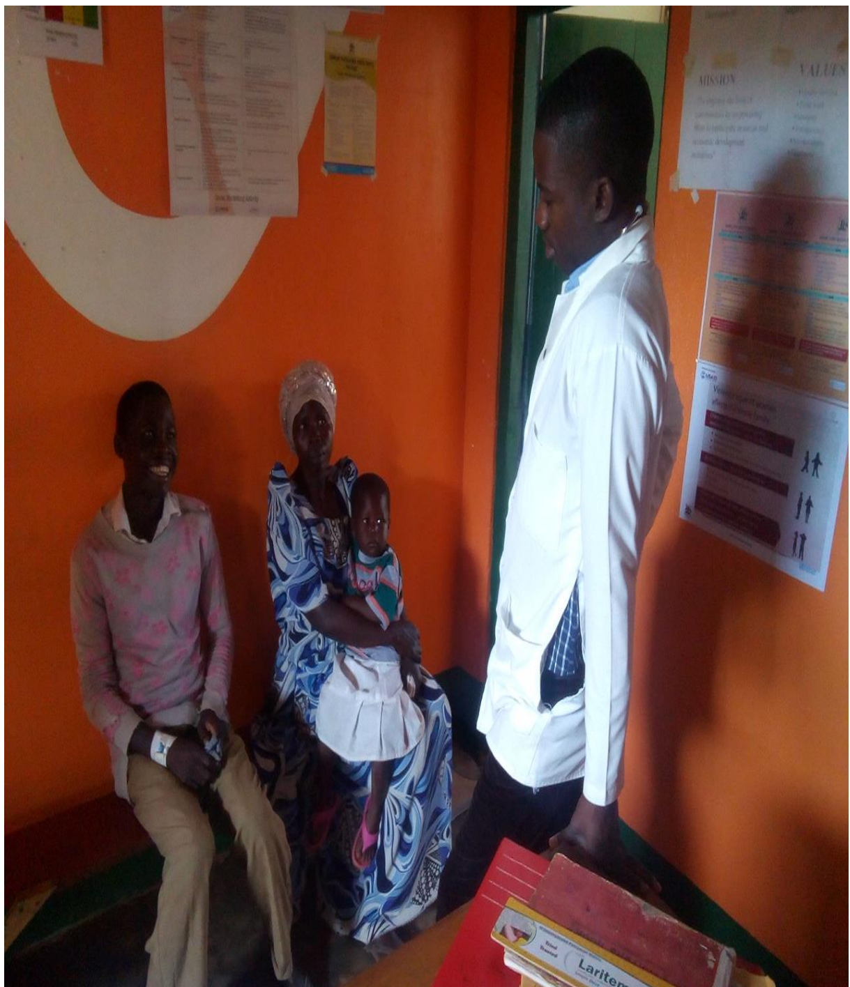
A clinical officer offering health education to in patients.